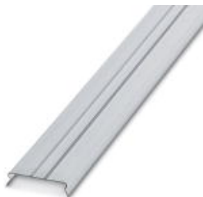
Cover profile, length: 46 mm, width: 1000 mm, height: 9.8 mm, color: transparent

Please be informed that the data shown in this PDF Document is generated from our Online Catalog. Please find the complete data in the user's documentation. Our General Terms of Use for Downloads are valid ( http://phoenixcontact.com/download )