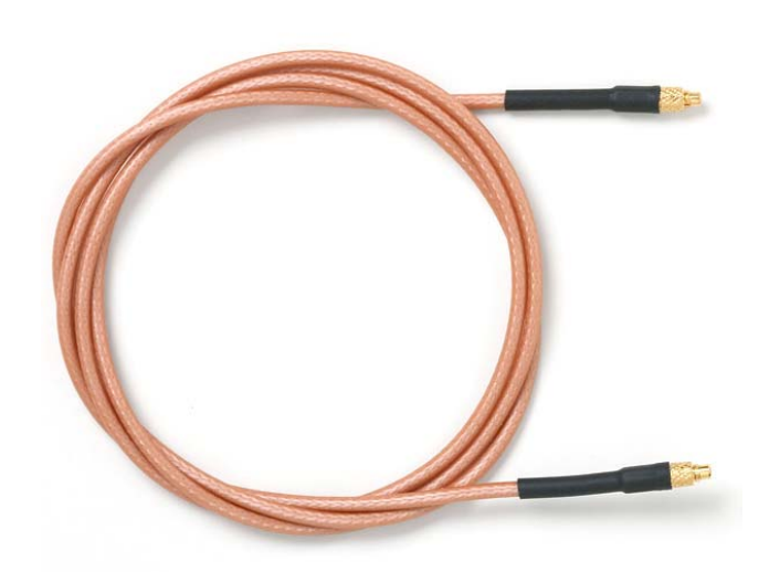
Model 73063 MMCX Plug to MMCX Plug, RG316/U

Snap-on coupling and microminiature size for fast connect and disconnect where space is limited